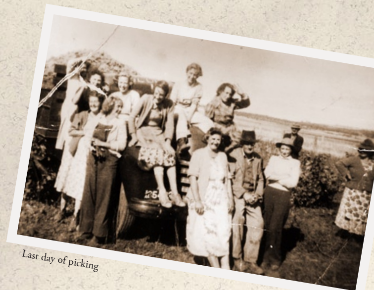
Last day of picking